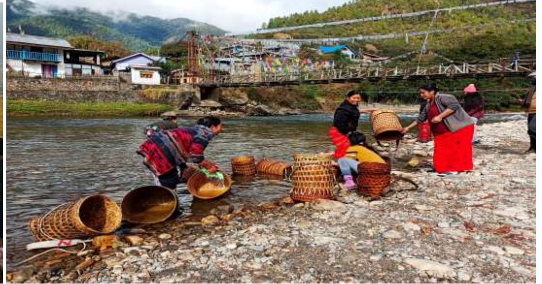
Glimpses of Socio-ecology: Sun-drying, Mulching, Farming