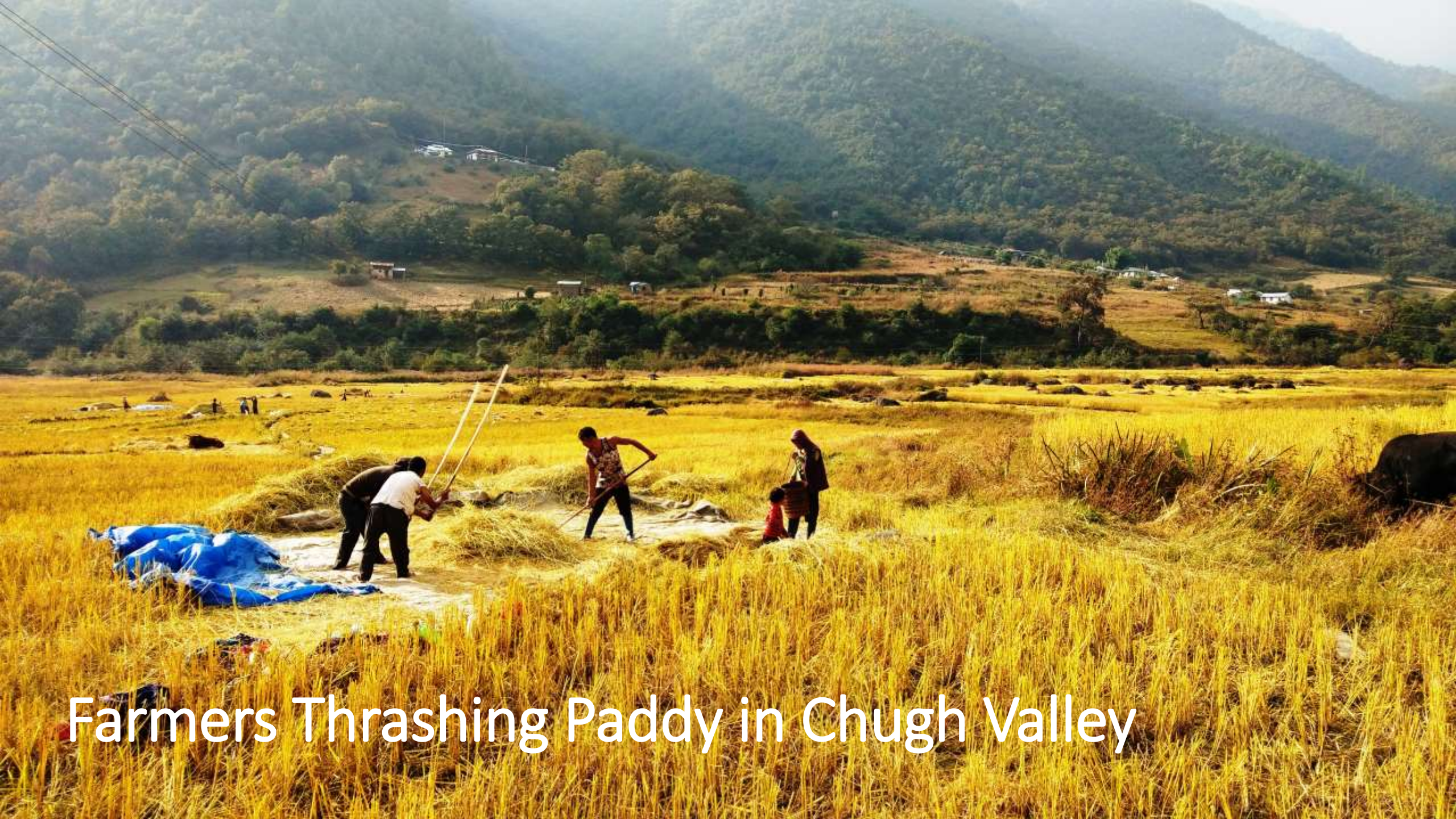
Farmers Thrashing Paddy in Chugh Valley