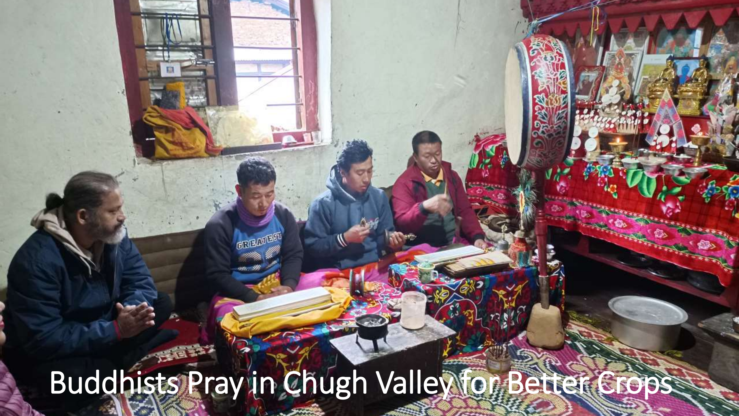
Buddhists Pray in Chugh Valley for Better Crops