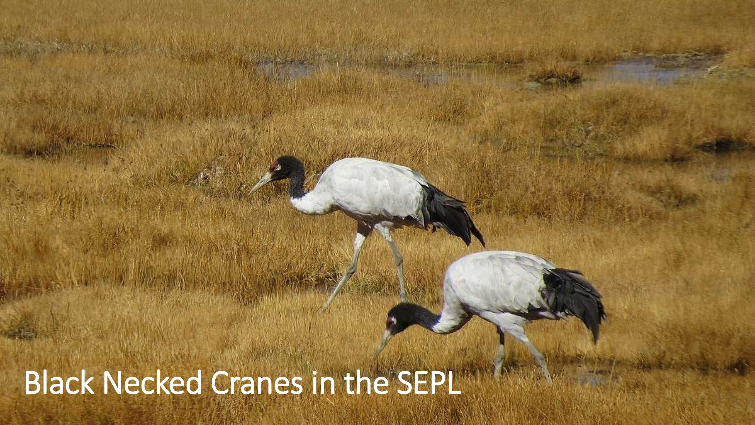
Black Necked Cranes in the SEPL