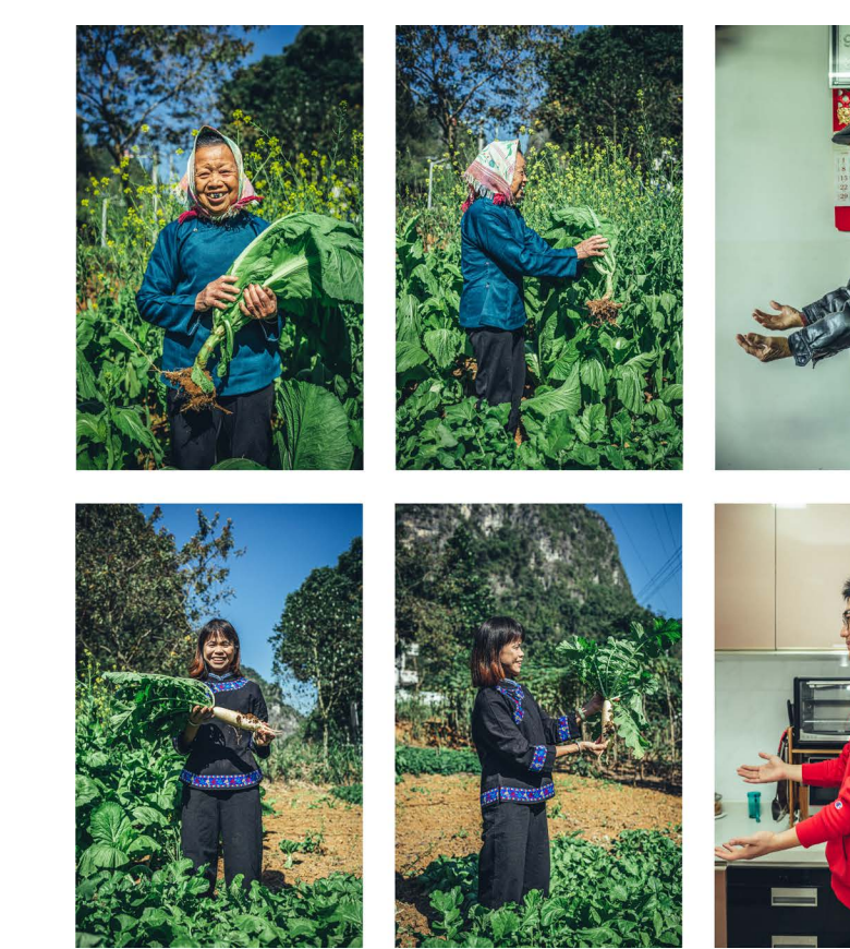
种得安心,吃得放心,生态种植在农人和消费者之间互递信任 From Seed to Table: know your food back to its source