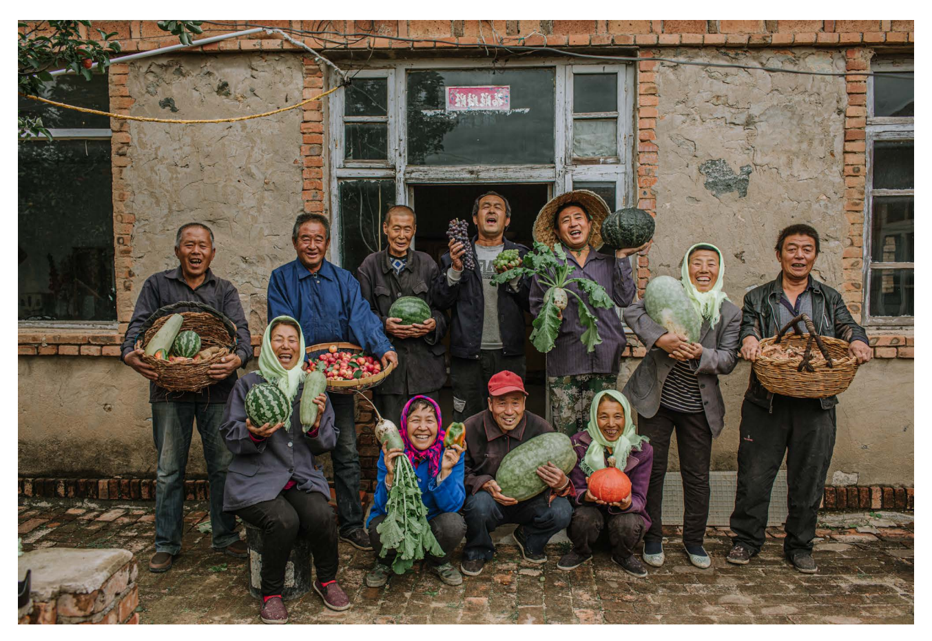
内蒙古敖汉旗横沟子村收获季节忙碌而喜悦的农人 Joyful farmers at harvest season, Henggouzi village, Aohan Banner, Inner Mongolia

江苏昆山悦丰岛有机农场的农人分享水稻丰收的喜悦 Joyful farmers at harvest season in Yuefeng Island Organic Farm, Kunshan, Jiangsu