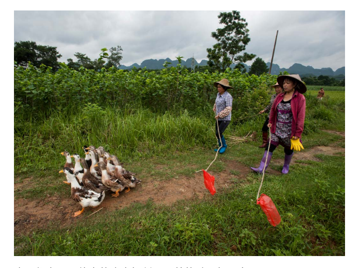
广西都安县弄律屯的农户把稻田里养的鸭子赶回家 Rice-duck farming for pest control in Nonglv village, Du'an county, Guangxi