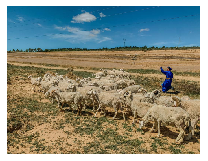
位于农牧交错带的内蒙古敖汉旗是"小米之乡",八千年粟文化发源地 Aohan Banner in Inner Mongolia, a farming-pastoral ecozone, the cradle of millet culture