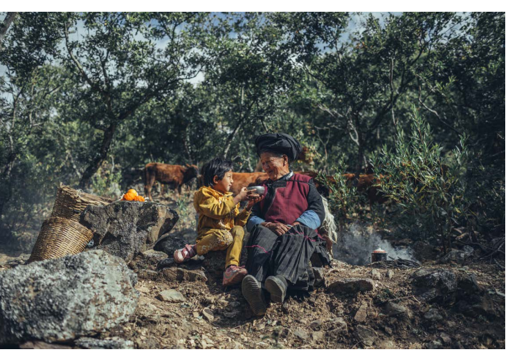
云南丽江油米村 · 放牛的老人和孩子 Granny and granddaughter herding cattle together,Youmi village, Lijiang, Yunnan