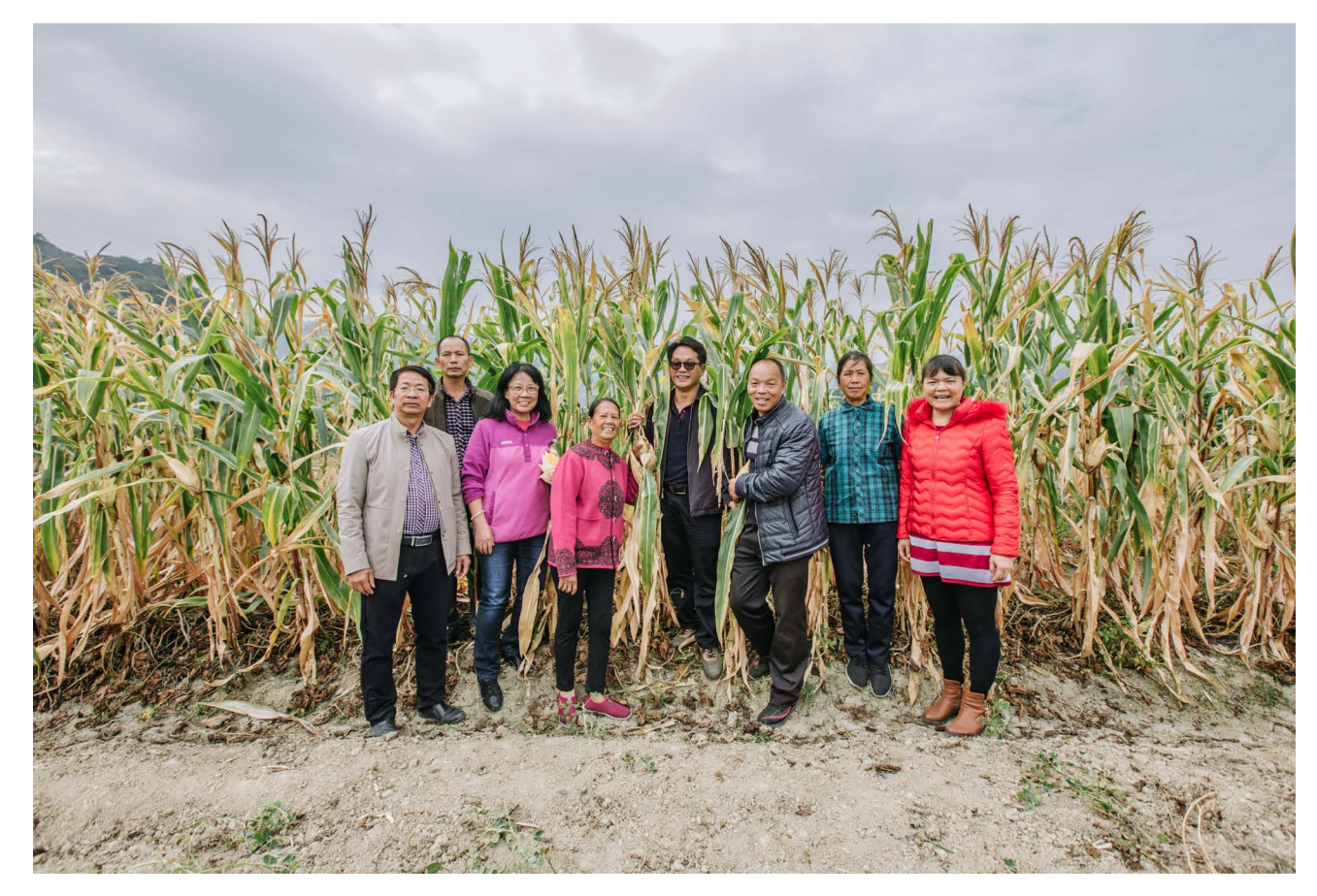
2019年,广西参与式选育种的农民和专家再聚首 Twenty-year Reunion of Participatory Plant Breeding Farmers and Experts at Linlu village, Wuming county, Nanning, Guangxi in 2019

2000年,广西武鸣县,中国的参与式选育种从这里开始 Participatory Plant Breeding Farmers and Experts at Linlu village, Wuming county, Guangxi in 2000