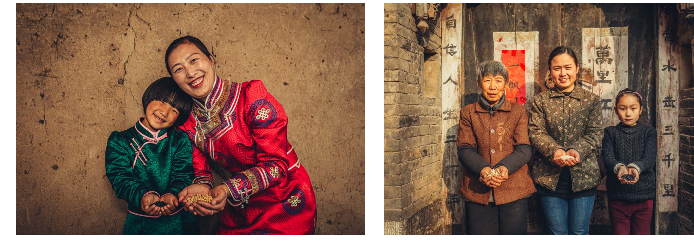
种子,滋养着家殷人足,维系着家园故土,承载着家国情怀 Seeds, nourishing families, sustaining homeland, and carrying national sentiment