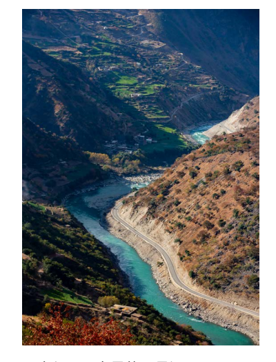
云南与四川交界的无量河 Wuliang River at the Yunnan-Sichuan border