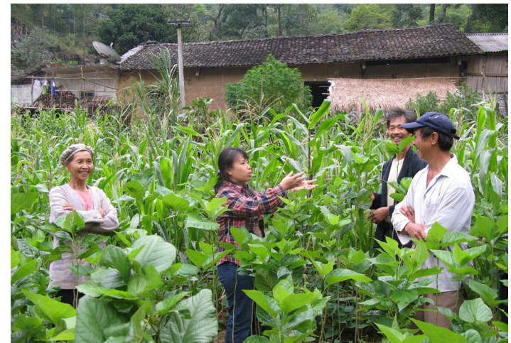
育种专家在田间指导农户进行农家品种的提纯复壮 Participatory Plant Breeding Farmers and Experts at Guangxi