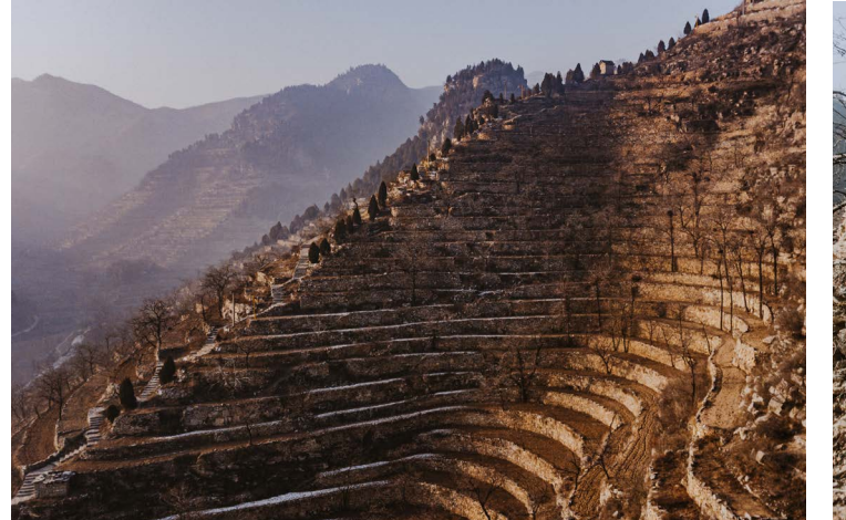
河北涉县王金庄村蔚为壮观的旱作梯田 The spectacular dryland terrace system hills in Wangjinzhuang village, She county, Hebei