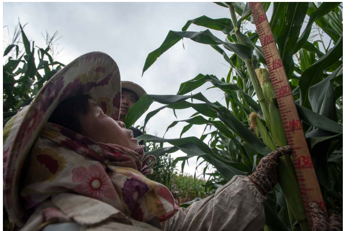
参加育种试验的广西农人 Participatory Plant Breeding field observation at Guangxi