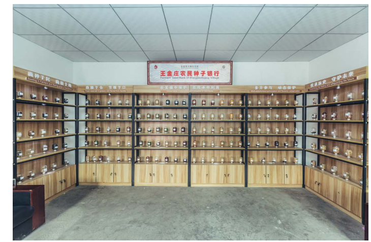
河北涉县王金庄村的农民种子银行 Wangjinzhuang community seed bank

云南丽江石头城村的纳西妇女交换种子 Seed fair in Stone Village, Lijiang, Yunnan