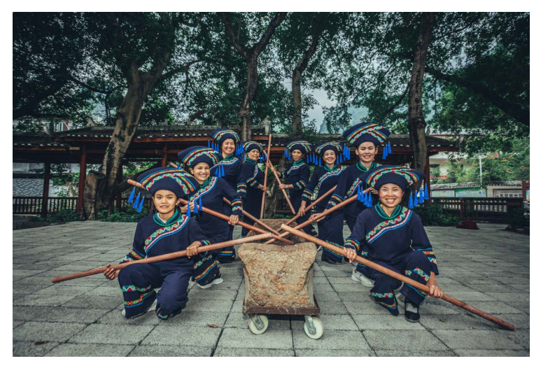
广西马山县上古拉屯的妇女传承当地非遗文化——打榔舞 Intangible cultural heritage - Hammering dance in Upper Gula village, Mashan county, Guangxi