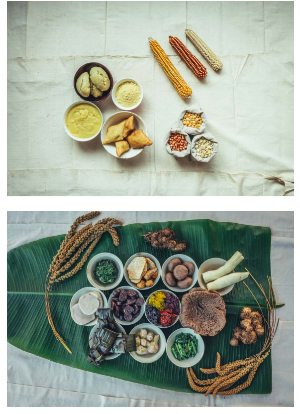
河北涉县王金庄村玉米制成的菜肴(上) 广西隆安更丹屯当地特色美食(下) Gourmet maize dishes from Wangjinzhuang village, Hebei (up) Local cuisine, Gengdan village, Long'an county, Guangxi (down)